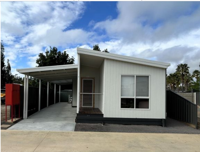
Examples of recently built pre-fab homes at Nagambie Lifestyle Park

Close proximity to Eureka's All Age Rental Community (Benalla) and Seniors Rental Living Villages (Shepparton and Albury)